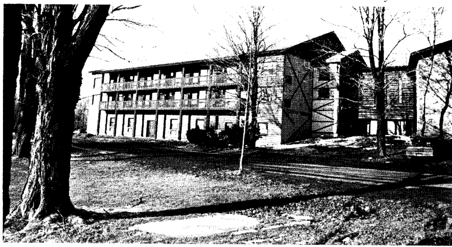
COMPLETE FACELIFT: Renovated motel exterior blends into the rustic country setting of Indian Lake.