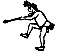
SKEET & TRAP