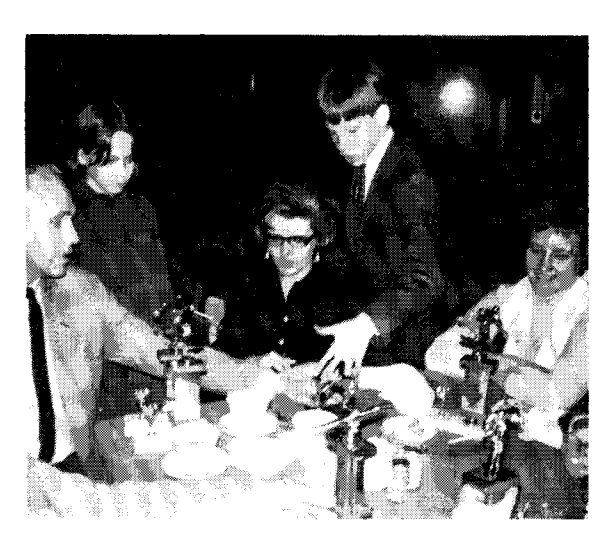
Winner's table at the banquet.