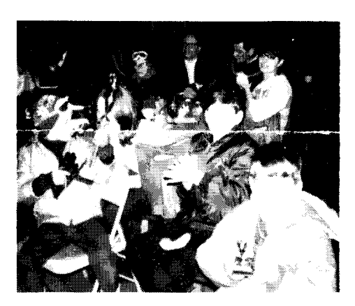
Proud slalom skiers with trophies.