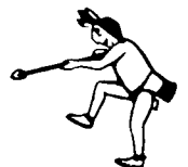
SKREET & TRAP