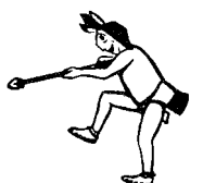
SKREET & TRAP