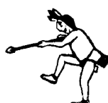
SKEET & TRAP