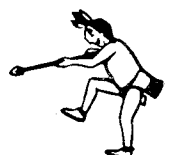
SKEET & TRAP