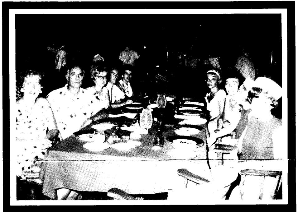
Guests enjoyed the dancing held before and after dinner at the 2nd Annual Lake Stony Creek Party

It appears as if this will be one of the big annual parties for years to come here at the Lake and one we will all look forward to. (Isn't it wonderful how easily traditions of this kind are formed among friends and neighbors at Indian Lake?).