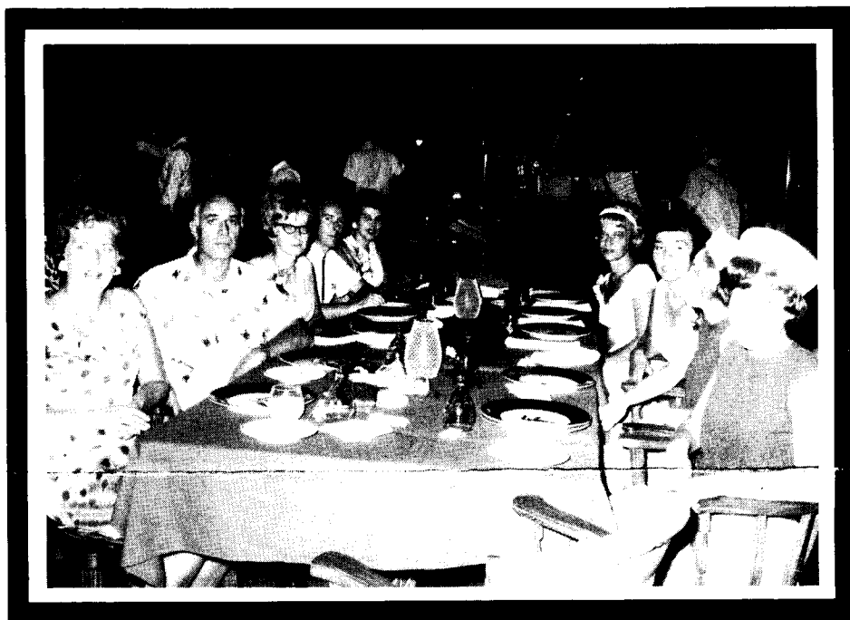
Guests enjoyed the dancing held before and after dinner at the 2nd Annual Lake Stony Creek Party

It appears as if this will be one of the big annual parties for years to come here at the Lake and one we will all look forward to. (Isn't it wonderful how easily traditions of this kind are formed among friends and neighbors at Indian Lake?).