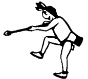
SKEET & TRAP