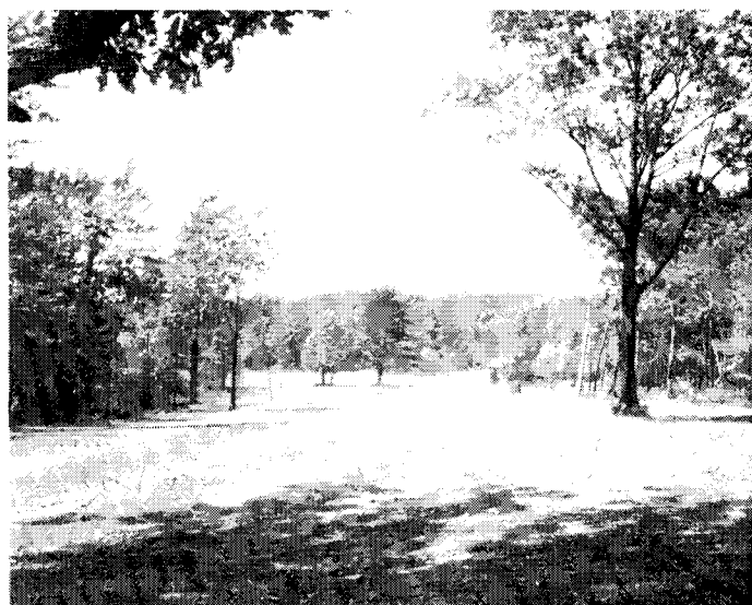
No. 13 Par 4 360 Yards

By varying the pin positions and tee markers, No. 12 at Indian Lake will always be a great par 3.