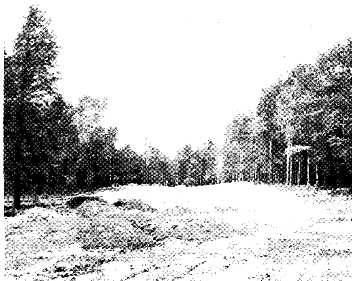
No. 12 Par 3 200 Yards

Arnold Palmer is spending more time at Indian Lake now that his design of the new 18 hole championship golf course is taking a more definite shape. Brief descriptions of the back nine holes will be printed in future issues of THE SMOKE SIGNAL. In this way it is hoped that members can share in the enthusiasm Arnold Palmer has for Indian Lake and the new golf course. Plans call for the back nine to be seeded this fall, and possibly be ready for play in 1968.