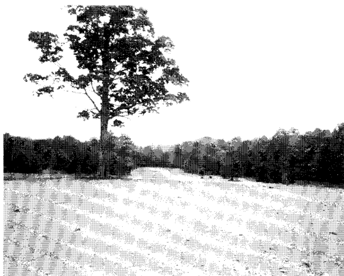
No. 11 Par 4 440 Yards

Lined with trees from tee to green, No. 10 fairway is quite narrow and has a slight dogleg right. This bend in the fairway calls for an accurate second shot as well as the drive. It will take a strong, well-placed tee shot to be in a position to reach this green in two. The green is hemmed in by trees and surrounded by two sand traps.