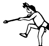
SKEET & TRAP