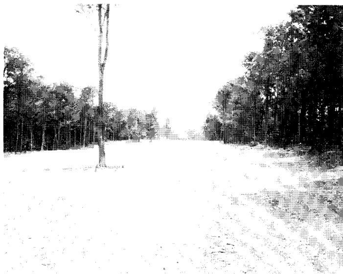
No. 10 Par 5 540 Yards

Arnold Palmer is spending more time at Indian Lake now that his design of the new 18 hole championship golf course is taking a more definite shape. Brief descriptions of the back nine holes will be printed in the next four issues of THE SMOKE SIGNAL. In this way it is hoped that members can share in the enthusiasm Arnold Palmer has for Indian Lake and the new golf course. Plans call for the back nine to be seeded this fall, and possibly be ready for play in 1968.