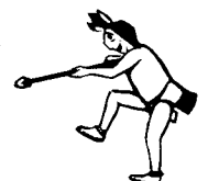
SKREET & TRAP