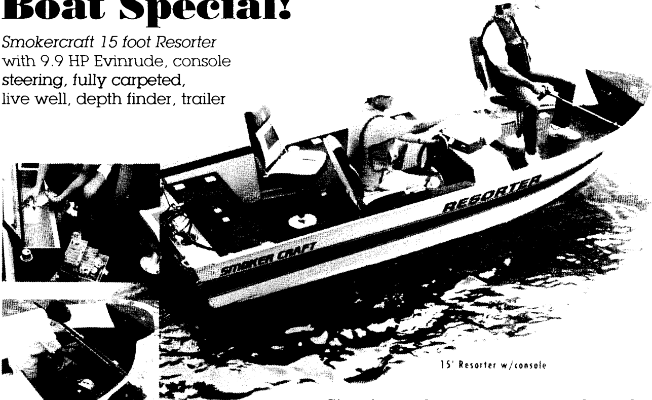
15' Resorter w/console

Smokercraft 15 foot Resorter with 9.9 HP Evinrude, console steering, fully carpeted, live well, depth finder, trailer