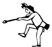
SKEET & TRAP