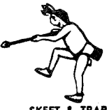
SKEET & TRAP