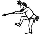
SKREET & TRAP