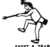
SKEET & TRAP