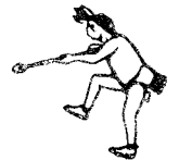
SKEET & TRAP