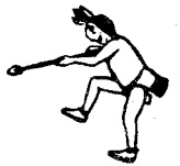
SKEET & TRAP