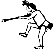
SKEET & TRAP